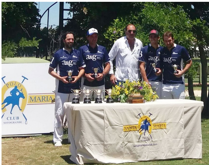
Team Ayala, winners of the medium goal tournament