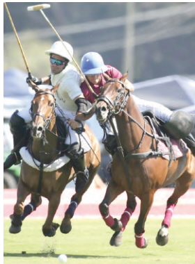
US Polo Season - P 3