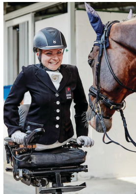
Culture - P 7

This year's edition was a glittering affair, with a mix of high-profile Hollywood projects and auteur-driven smaller films capturing attention.