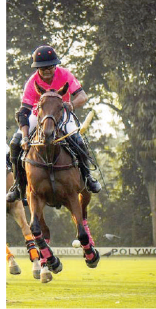
FINAL Jaipur vs V-Polo DATE: 127 OCTOBER

TJaipur and V-Polo were the two names who qualified for the finals of this year's General Amar Singh Kanota Cup. After losing to Jaipur in the tournament's second game, V-Polo was looking to avenge themselves, but Jaipur was ready for the challenge. Jaipur gained control towards the end, making V-Polo struggle to score any extra goal, which made coping with the lead difficult. The decisive plays made by Jaipur were enough to outplay V-Polo once again and become the champions of the General Amar Singh Kanota Cup.